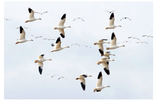
Snow Geese, Hamlin