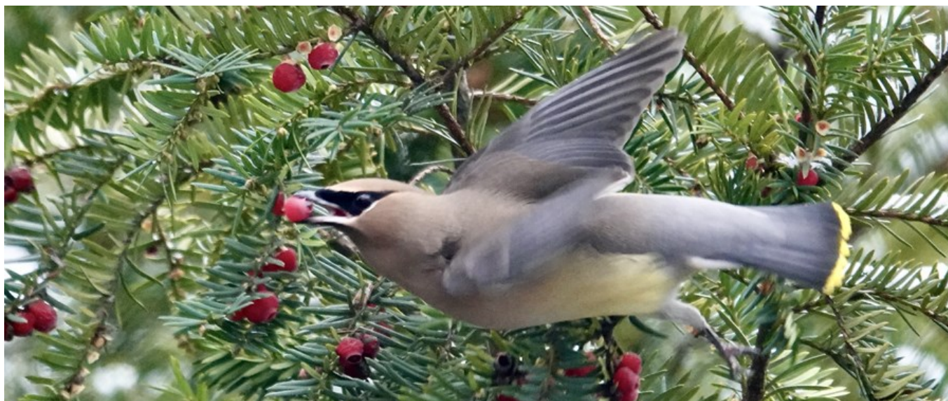
Cedar Waxwing, Mill Creek Landing January 1, 2024