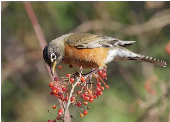
American Robin - Webster Park - Alan Bloom - December 13, 2022