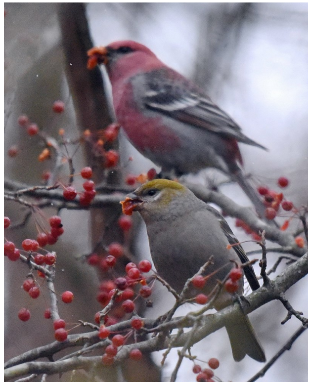
Pine Grosbeak - Webster Park - December 9, 2022

The January meeting will NOT have a Zoom component. Please come and vote on the new slate of officers (listed on page 5), enjoy what is always a great meal, and see presentations by our members. See you soon!