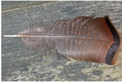
A Wild Turkey tail feather.

Hint: you'll probably find them around your feeders.