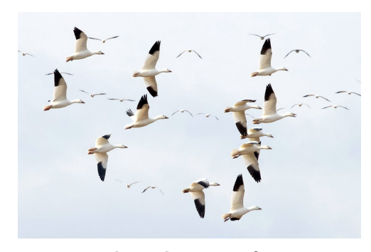
Snow Geese, Hamlin 2/20/23