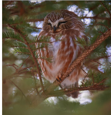
Northern Saw-whet Owl - Owl Woods - Mar 01, 2021