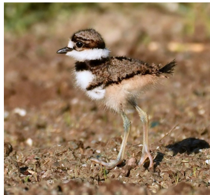
Killdeer (Juv) - Braddock Bay East Spit - © Alan Bloom - Jun 06, 2021