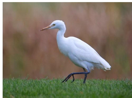
Cattle Egret - Webster © Suzie Webster— Nov 09, 2021