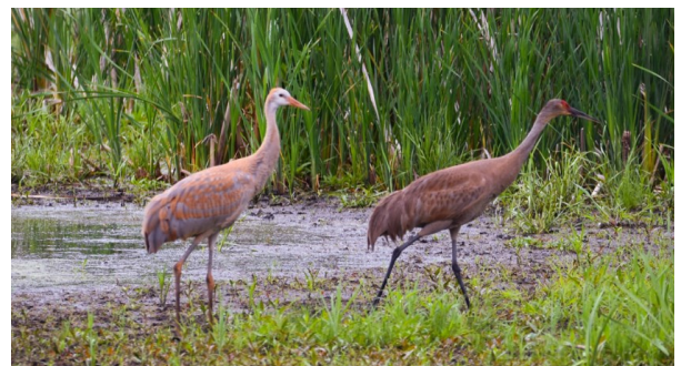
Sandhill Crane - Montezuma NWR - Jul 10, 2021