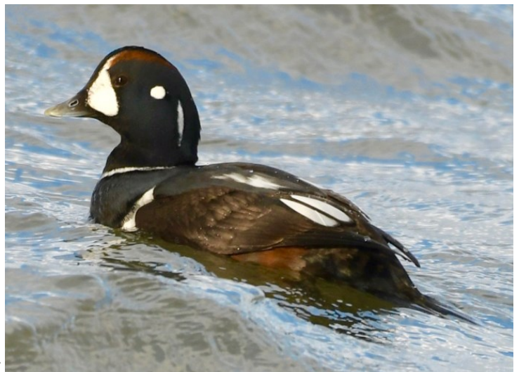
Harlequin Duck - Round Pond— - Dec 04, 2021