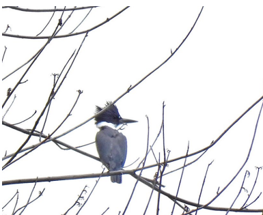
Belted Kingfisher - Braddock Bay East Spit - © Candace Giles - Sep 13, 2021