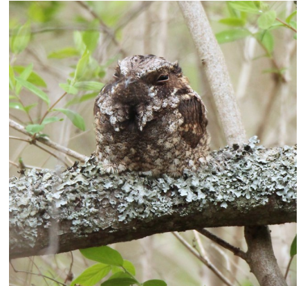
Whip-poor-will - Owl Woods - May 03, 2021