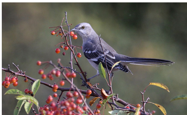
Northern Mockingbird - Buckland Park - © Jeff Eichner - Oct 11,