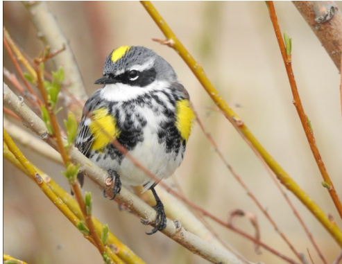
Yellow-rumped Warbler - Braddock Bay East Spit - Apr 27, 2021